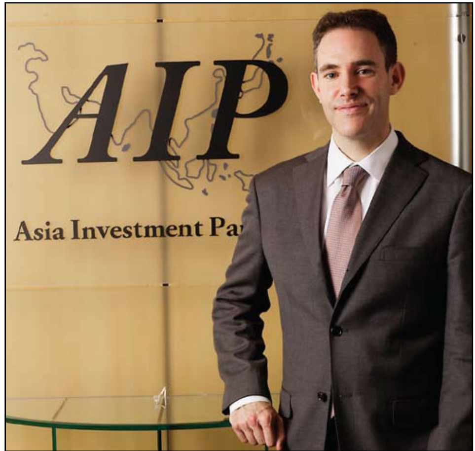
ASIA INVESTMENT PARTNERS