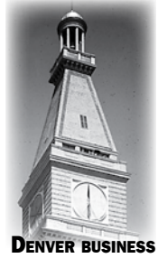
DENVER BUSINESS DYNASTIES